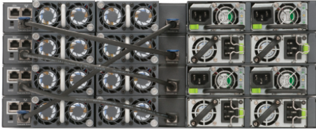
Rear View (highlighting Stackable Chassis cabling)