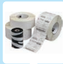
Consumables (labels, ribbons, PVC cards)